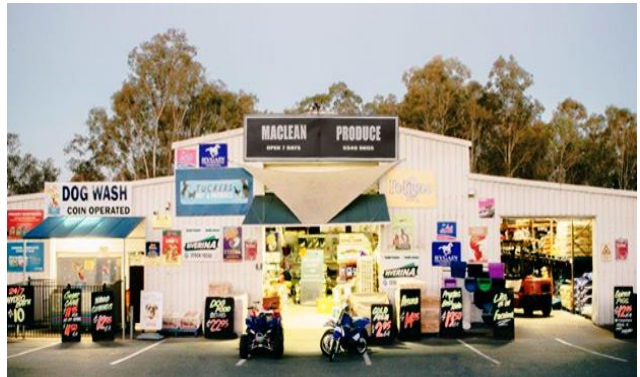
North Maclean Produce