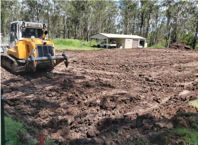
Earthworks done on 3 rd December 2021 by Bigboss Concreting contractor. A lot of mud was removed due to soft surface caused by heavy rains. Approved plans require the levels to meet the council flood level guidelines.