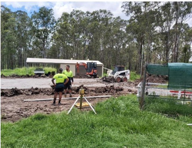
Bigboss workers levelling the pad and preparing to dig trenches for the foundation on 6 th December 2021. Fortunately, further works were prevented to meet the approved floor levels and work will continue once the issue is resolved. Engineers have been working with the council to meet the minimum requirements.