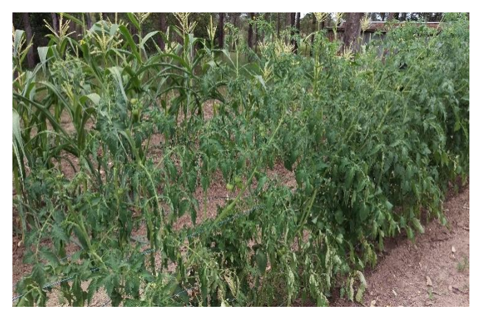
Fruiting tomatoes in front of flowering corn, wilted slightly due to dry weather. Getting ready for harvest soon