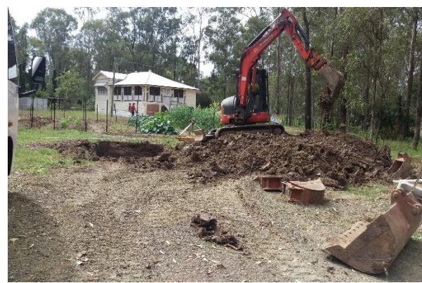
Upgrading ATAC sewerage system by Express Wastewater Solutions, with Aqua Nova tanks and complete new piping system.

In the next few weeks, I will be actively contacting parents who have outstanding fees. If you wish to change your payment option, could you please advise us in writing to finance@atac.qld.edu.au. We welcome over the phone payments, along with cash and direct transfers.