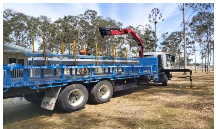
Delivery of shed roller doors from Stratco for our multipurpose shed