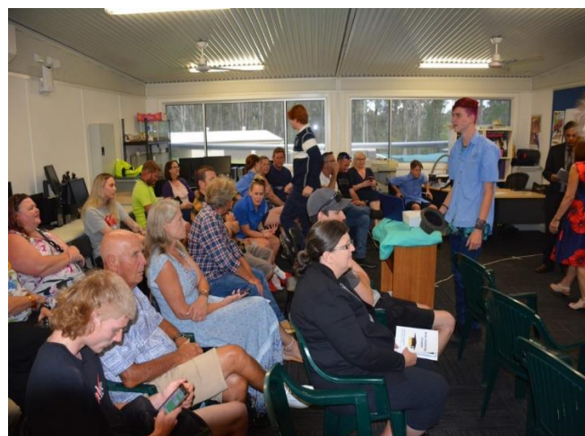
Parents and Guardians at the 2021 Graduation Function held on Wednesday 17 th November 2021.