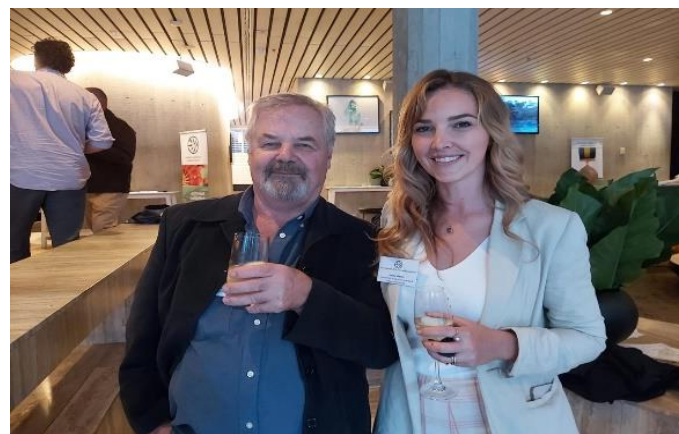
Members of AIH Board who have expressed interest to be at our upcoming Bushfoods Conference. Working in the Landscape designs is a great pleasure for them.