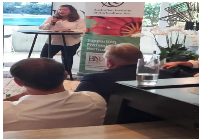
Experience shared at the conference travelling across Australia meeting with many Indigenous communities and Bushfoods people providing a lot of inspiration and knowledge about the benefits and opportunities of using bush foods for various cuisines.