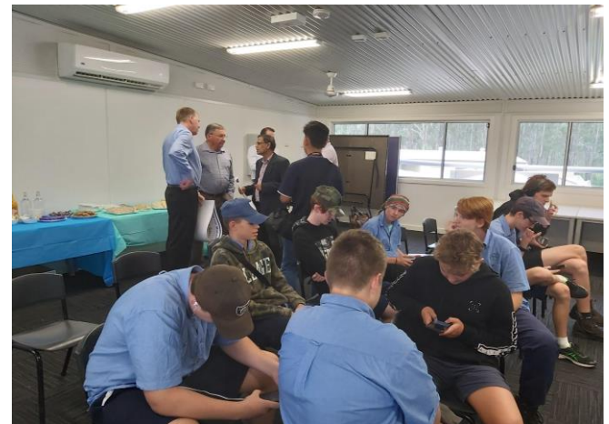
A casual chat after the presentation.