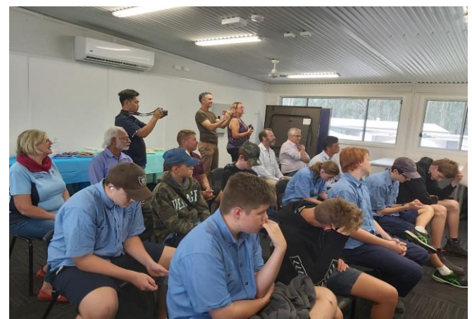
Parents, business partners and news reporters with ATAC students listening to the presentation.