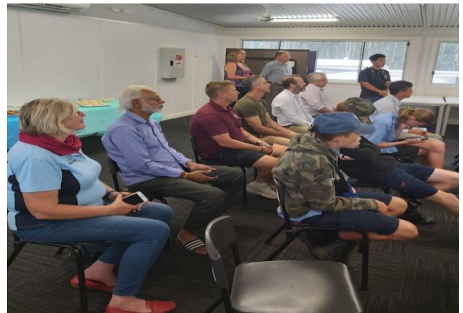
Guests seated with ATAC students.