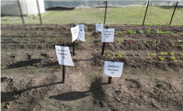
Student gardens prepared. Soon the vegies will be ready for use or sale.