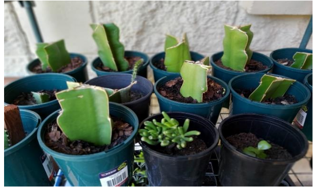
Dragon fruit and succulents showing new growth. Have patience boys. They will grow slowly