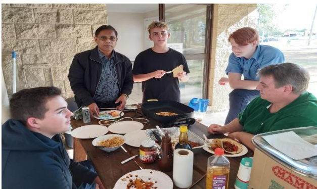
Students and staff enjoying BBQ lunch