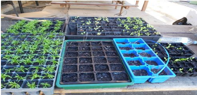
Left-Seedlings for the gardens.