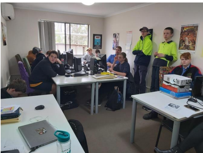
Keen students thinking of their future enrolment At TAFE