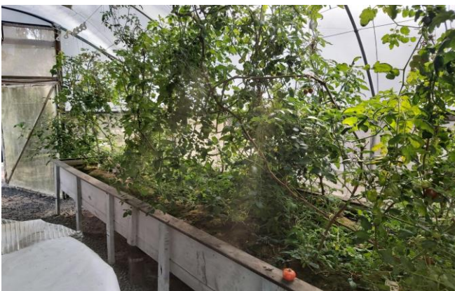
Different varieties of Tomatoes available all year around