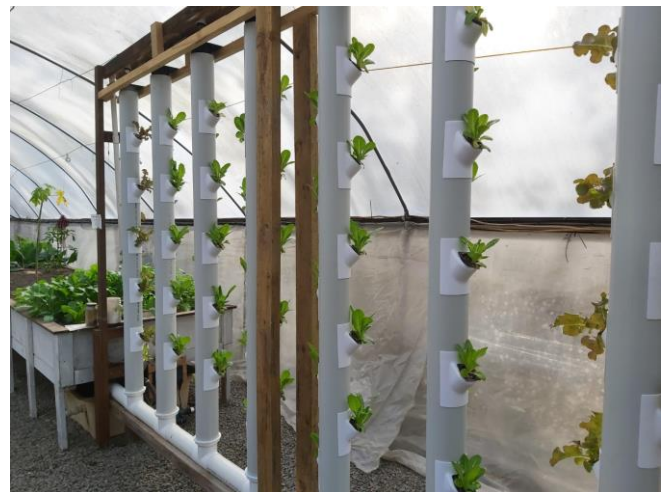
Lettuce grown in vertical set up as a space saver