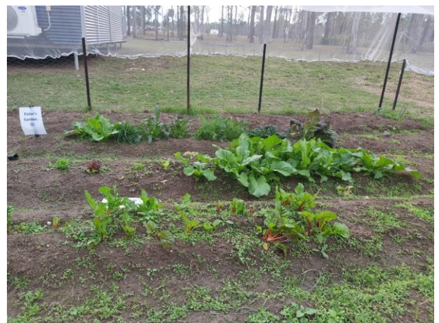
Organically grown vegetables by students is nearly ready for harvest to be used in Life Skills lessons.