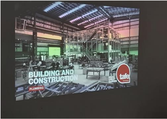
TAFE AT SCHOOL