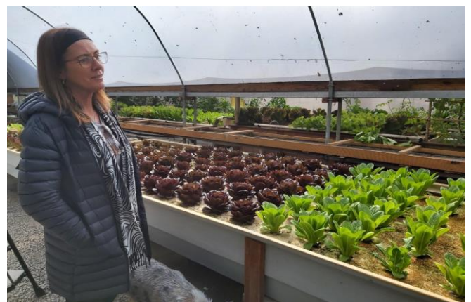
Three different varieties of lettuce provide a colorful look