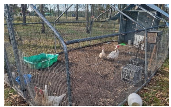
The lonely chooks and ducks after the sale of most of the flock to generate a small income. The chooks and ducks were raised as part of year 10 Agricultural Science projects. The knowledge and skills will help young people to care for and grow poultry as a hobby or as small business enterprises at any time in the future.