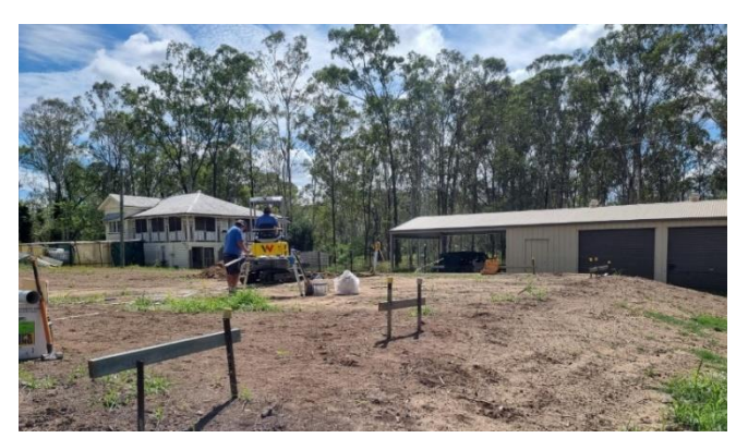
The raised pad level to meet the Logan City Council flood levels. The shed project was delayed for two years due previous contractor error. What a great relief.