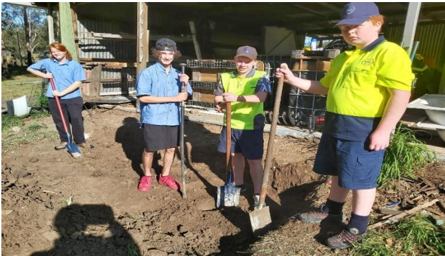
Students digging the sump pit for Aquaponics