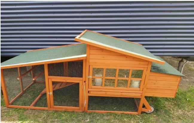
Chicken Coop, an exciting project which keeps most students busy during breaks. Project started on -26 August 2020. Students are waiting for licenses to increase the numbers including egg-laying birds.