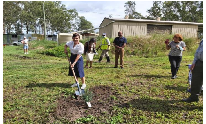
The Minister planting the first Bushfood plant (Finger lime) which is highly sought for its unique flavors