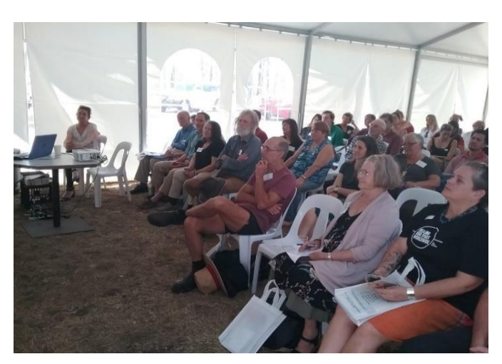
Attendees were enjoying at Bushfoods Conference.