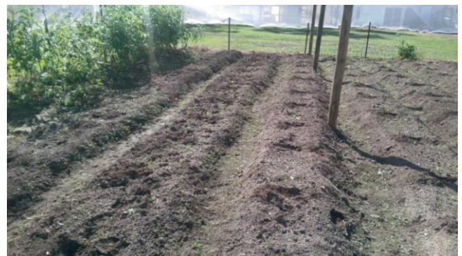
ATAC Gardens are ready for planting by North Maclean Community Garden (NMCg) members to be started as the weather becomes more favorable.