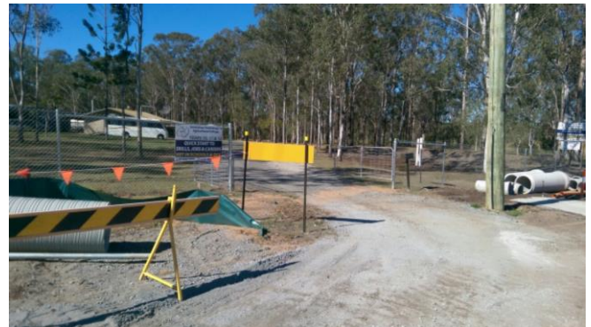
ATAC driveway awaiting completion. The front service road looks great with the drainage, kerb and footpath landscape.