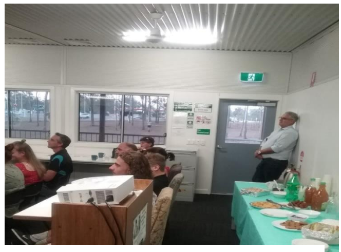
Guests attentively listening to the presentations

ATAC Well-Wishers supporting our students. They can be contacted on their websites.