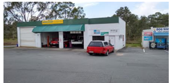
Roundhouse Workshop at North Maclean