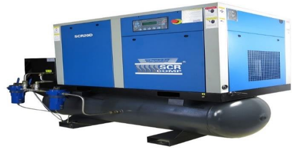
Compressor Technology QLD in Boronia Heights