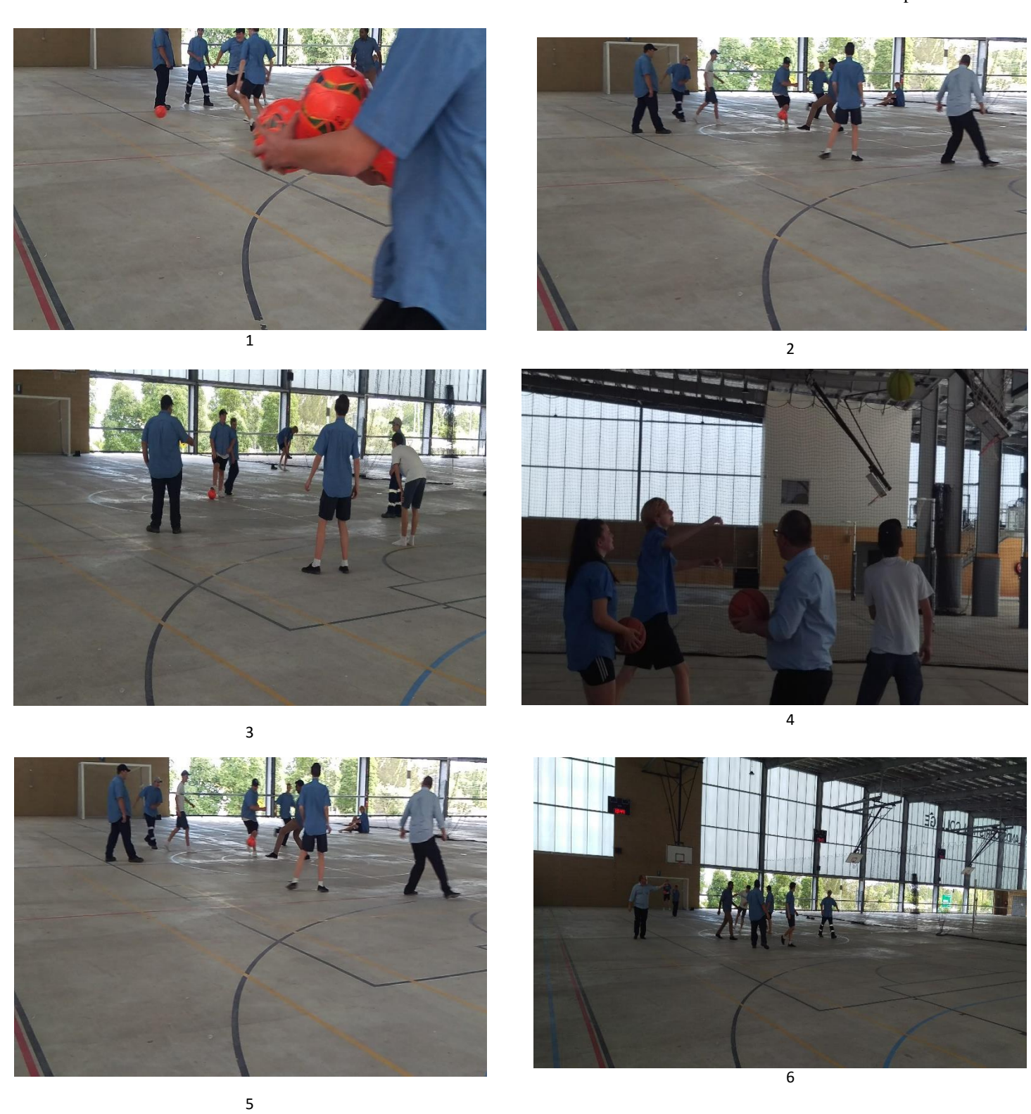
ATAC students playing Futsal at Parkland Christian College Sports Centre