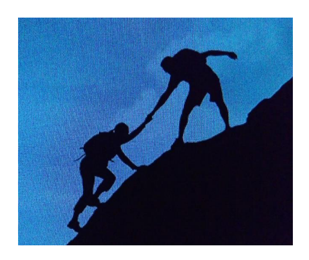
There is nothing impossible if you are determined to reach the heights, but you will always need a helping hand. You can succeed with the greatest load on your shoulders. There is always a way, if you have the determination.