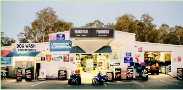
North Maclean Produce