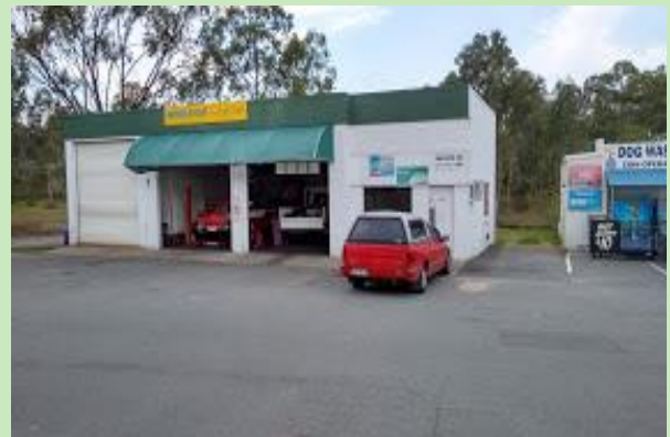
Round House Mechanical workshop at North Maclean North Maclean Produce Shop