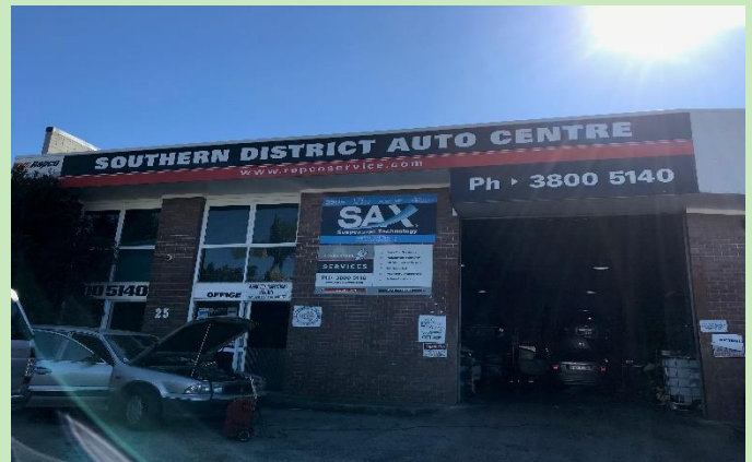
Southern District Auto Centre, Browns Plain