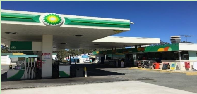
BP Service Station North Maclean & Regents Park