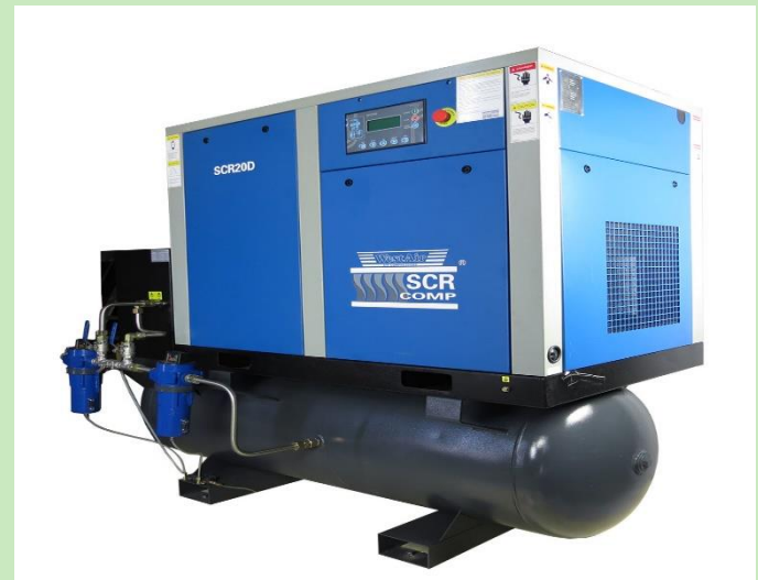
Compressor Technology QLD in Boronia Heights