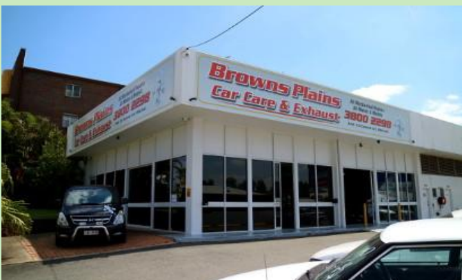
Car Care, Browns Plains