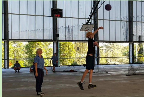
ATAC Students and Teachers enjoying sports at Parkland Christian College complex