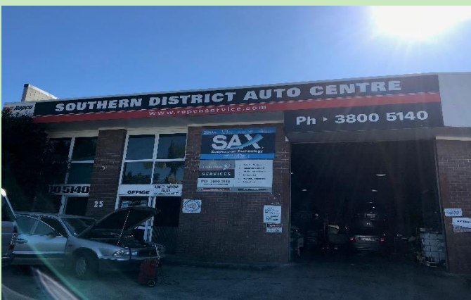
Southern District Auto Centre, Browns Plain