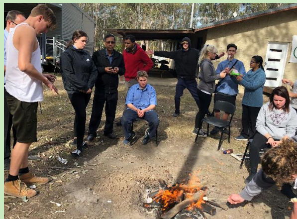
ATAC Students celebrating their end of semester on a cold winters day!