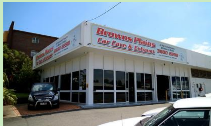
Car Care, Browns Plains