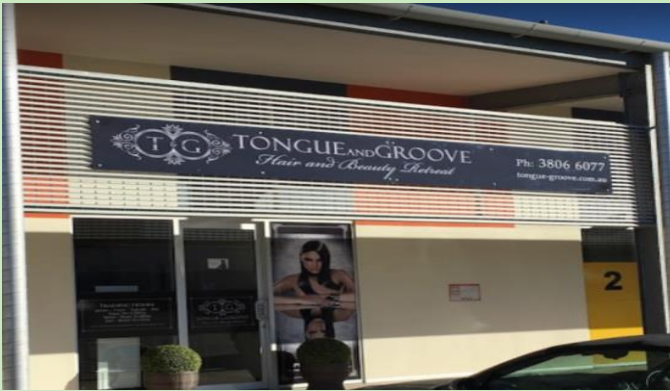
Tongue and Groove hair & Beauty Salon