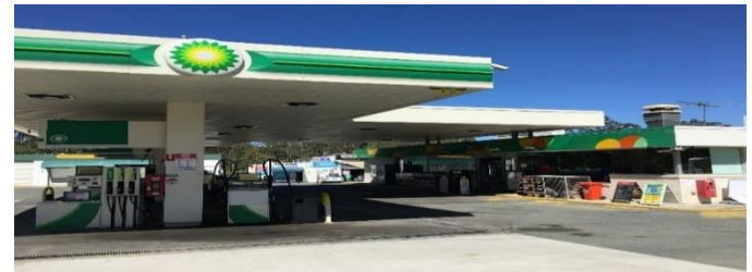
BP Service Station North Maclean & Regents Park