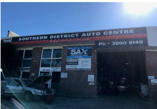
Southern District Auto Centre, Browns Plain