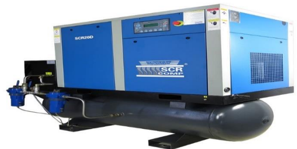
Compressor Technology QLD in Boronia Heights