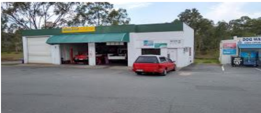
Round House Mechanical workshop at North Maclean North Maclean Produce Shop