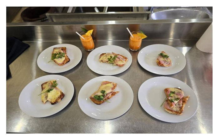
Kangaroo Nachos and Lemon Myrtle-flavored carrotpineapple-apple smoothie prepared for morning tea during the hospitality session with Marnie.