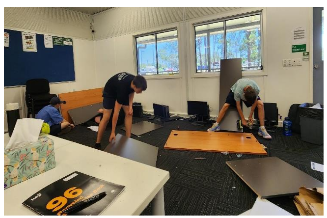
Students assembling their new furniture in the classroom. Greatly appreciated, boys.

for our classrooms in the first week of the term. Additionally, they have been busy preparing the plantar boxes for our autumn crops for our agricultural practices course. In doing so, they demonstrated their commitment to hands-on learning and sustainability.