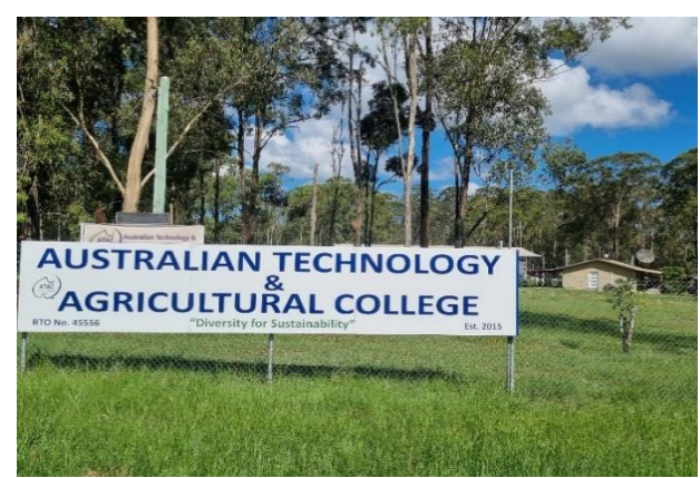
The new sign Board at the front gate is now visible from the Mount Lindesay Highway and Greenbank Road intersection..