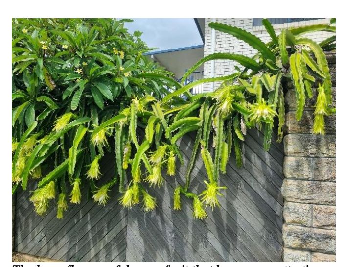
The huge flowers of dragon fruit that become an attrctive feature when they open up early morning and close around midday. The fenwers attract multiple visits from bees during the mornings to give almost 100% fruiting. Dragon fruit has significant nutritional health benefits due to their high antooxidant content.

Enrolment is open all year round for both online and face-to-face training. We offer customized learning plans to help students successfully complete their senior education. For further information, please feel free to visit us, email rbehal@atac.qld.edu.au, or call 5547 8598.