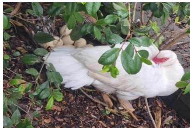
A duck finds the front of the admin building as the safest place to lay eggs. Her clutch has 17 eggs, and we look forward to a good number of ducklings in a few weeks. Agricultural Science students do poultry studies project.