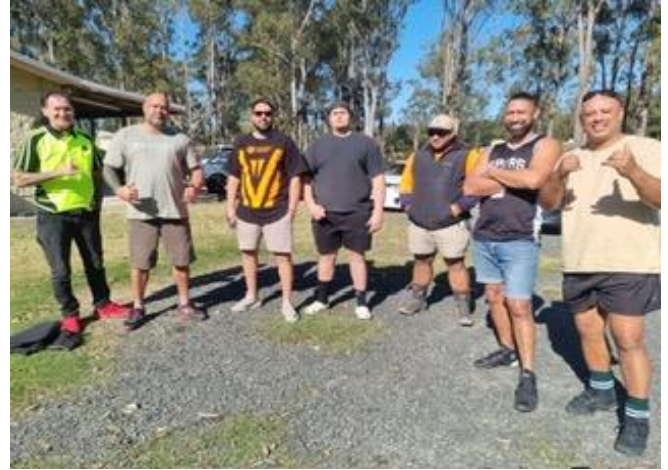
The members of the MAN-UP team volunteering at ATAC. They finished off the nursery, chicken pens, compound cleaning and checked out the ATAC bus which could be used for student transport.

Volunteers from “MAN-UP” and Destiny Relief Organization