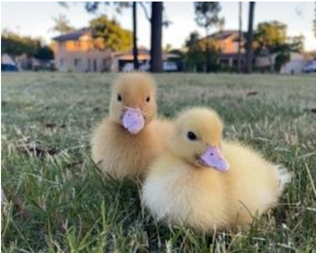
Ducklings at two weeks old enjoying the nature.