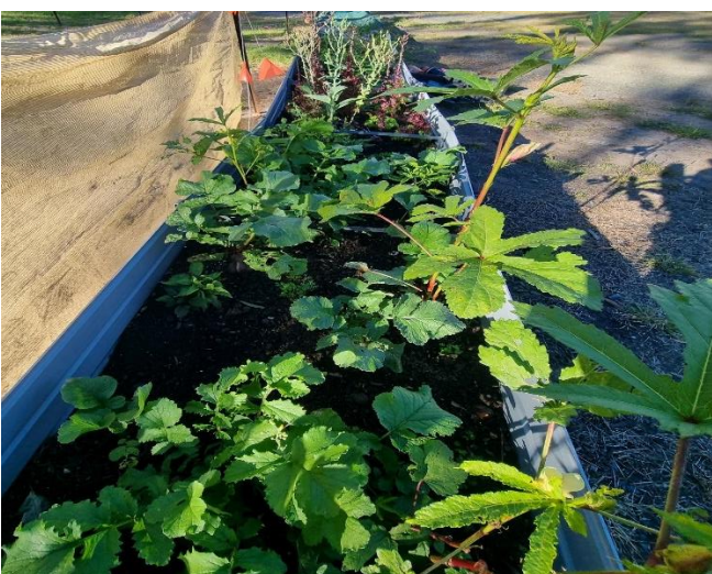
Raised garden bed with green and healthy vegetables. Thanks to students who have helped in watering and nurturing the gardens. Grow your own, eat your own and be healthy.