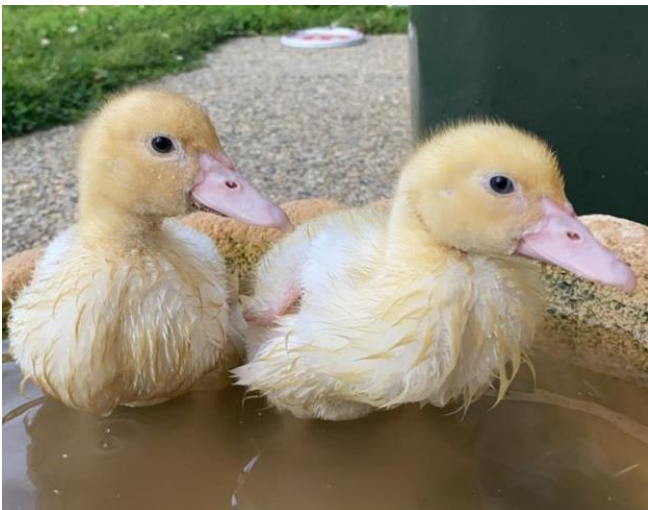
Ducklings at 2 months old loving the warm concrete and tiles around the buildings.