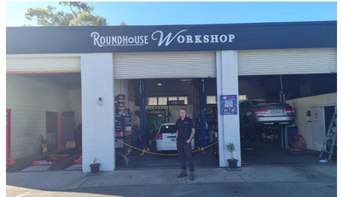
Roundhouse Workshop at Wearing Road North Maclean- supporting our studnest with work experience and automotive training.