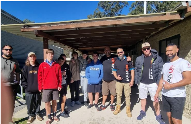
Members of the Destiny, Family and Community Organisation after talking to ATAC students.