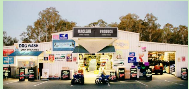
North Maclean Produce