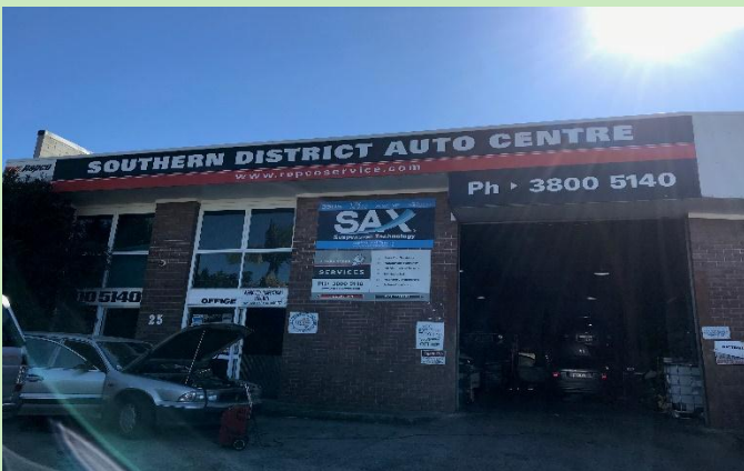
Southern District Auto Centre, Browns Plain