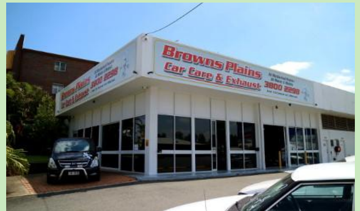
Car Care, Browns Plains