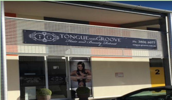
Tongue and Groove hair & Beauty Salon