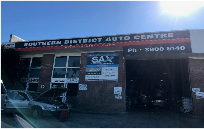
Southern District Auto Centre, Browns Plains