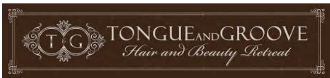
Tongue and Groove Hair & Beauty Salon