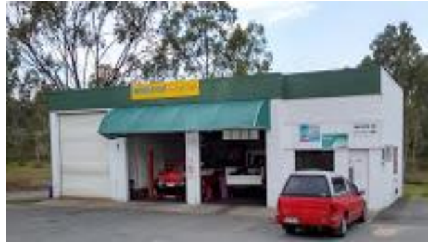
Round House Mechanical workshop at North Maclean North