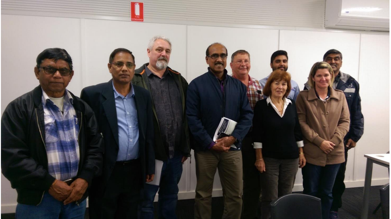
Above: ATAC Board & Committee Members