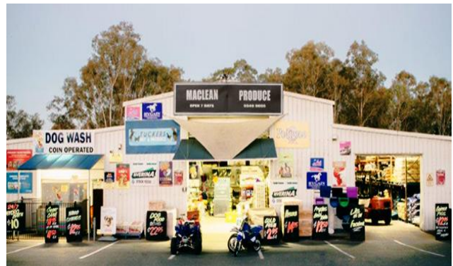
North Maclean Produce