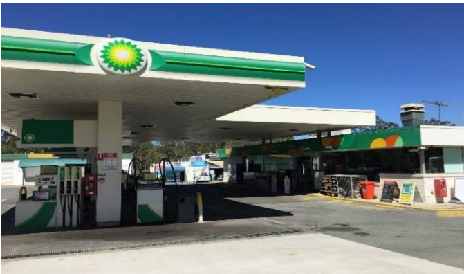
BP Service Station North Maclean & Regents Park