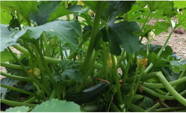
Flowering and fruiting zucchini - an extremely healthy crop which is proudly picked up by staff who have been watering and taking care of the gardens during the holidays. Thanks to Gary Nahrung for planting them and to all those who have been involved in nurturing them.