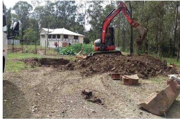
Upgrading ATAC sewerage system by Express Wastewater Solutions, with Aqua Nova tanks and complete new piping system.

In the next few weeks, I will be actively contacting parents who have outstanding fees. If you wish to change your payment option, could you please advise us in writing to finance@atac.qld.edu.au . We welcome over the phone payments, along with cash and direct transfers.