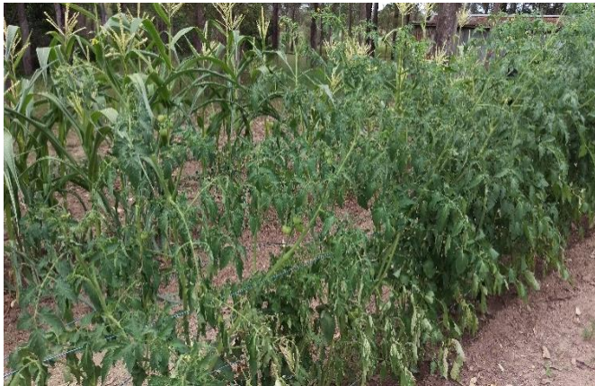
Fruiting tomatoes in front of flowering corn, wilted slightly due to dry weather. Getting ready for harvest soon